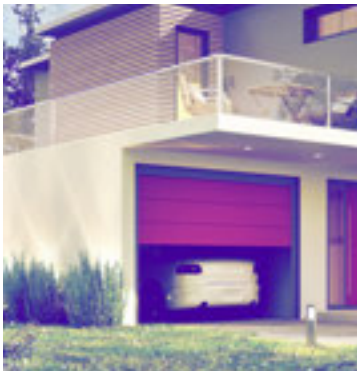
Car Left Running in Attached Garage