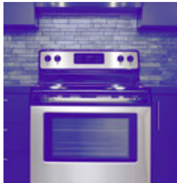
Improperly Installed Kitchen Range or Vent