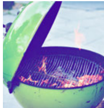
Operating a Grill Indoors or in Garage