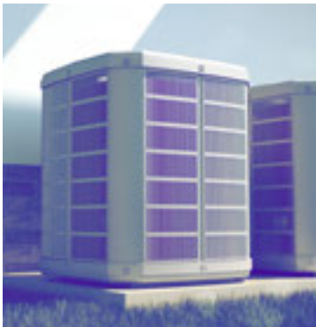
Loose or Broken Vent Pipes